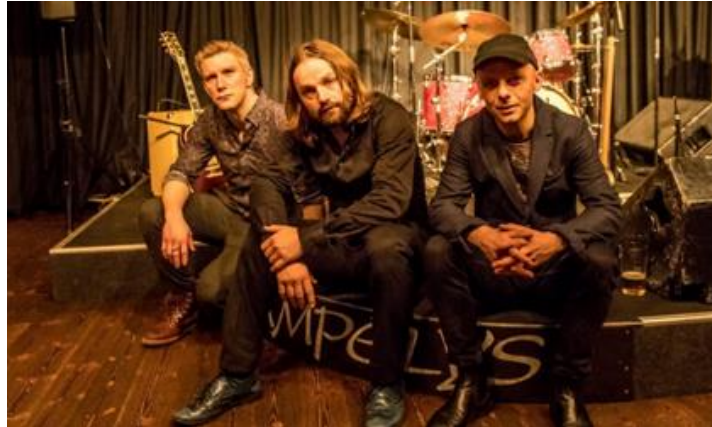
Fried Okra

Fried Okra is a band based in Copenhagen, Denmark. Their music has been called alternative blues. It gets its main inspiration from the Hill Country blues of the North Mississippi. However, nowadays the band write their own material and the live set consists of original songs.